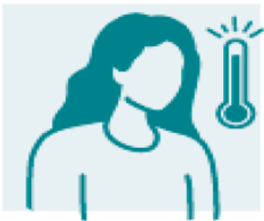
Fever, chills or sweats

You should get a test if you have symptoms such as these: