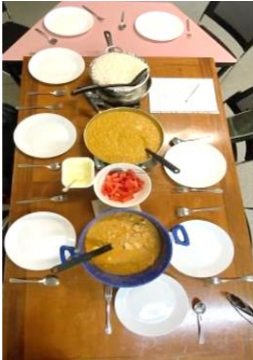
Figure 1. Meal prepared by program participants in the last session