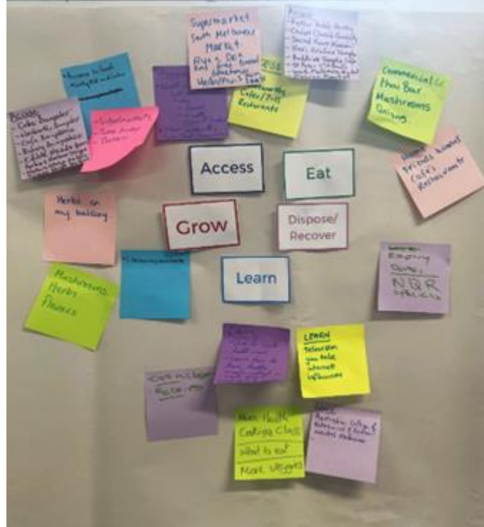
Figure 2. Co-design workshop for the development of the Port Phillip Food Environment map